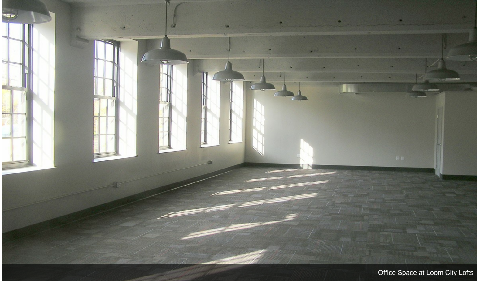
Office Space at Loom City Lofts