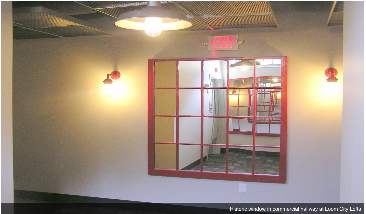
Historic window in commercial hallway at Loom City Lofts