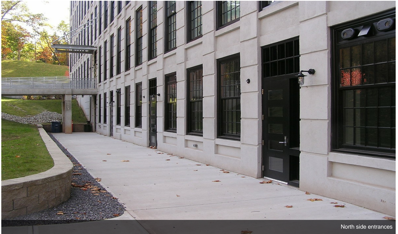
North side entrances