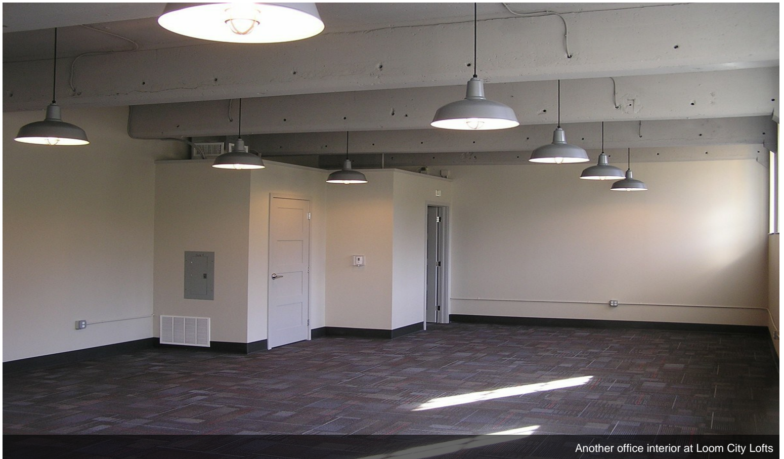
Another office interior at Loom City Lofts